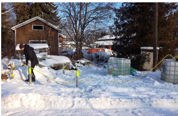
Peroxide injections at site Loppi.

Two new sites were introduced into the project INSURE in Midsummer 2018, Loppi and Karjaa, both located in Southern Finland. In Loppi, a small area contaminated with volatile oil hydrocarbons was treated by adding hydrogen peroxide in high concentrations into perforated injection tubes. Later on, the balance between different mechanisms of contaminant removal has been investigated in laboratory scale tests.