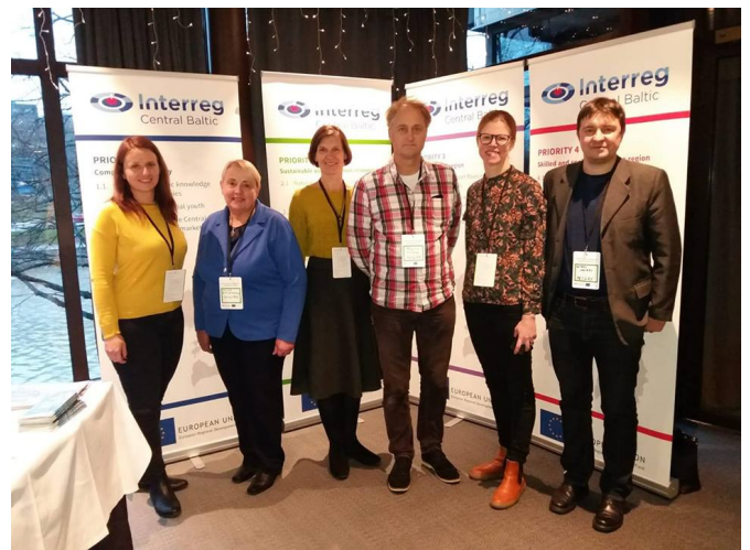
The INSURE team towards cleaner living environment with Central Baltic Programme: Region Östergötland, VPR, Valmiera and LVGMC representatives

“Interregional cross-border cooperation needs to be strengthened as the synergies helps to achieve more and face regional development challenges,” was the idea shared among participants of the Central Baltic Programme Annual Event in Turku on the 14th–15th November 2018