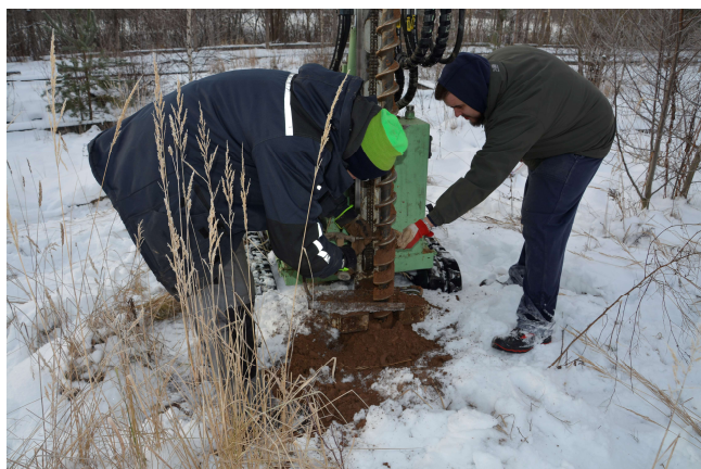
Soil sampling in Valmiera

taking part at the second soil sampling at Valmiera. The testing of the applicability and efficiency of the method will be finalized in April 2019 when the third soil sampling will be made and the soil samples will be tested. The results of all three samplings will be mutually compared and final report about results and method efficiency will be prepared.