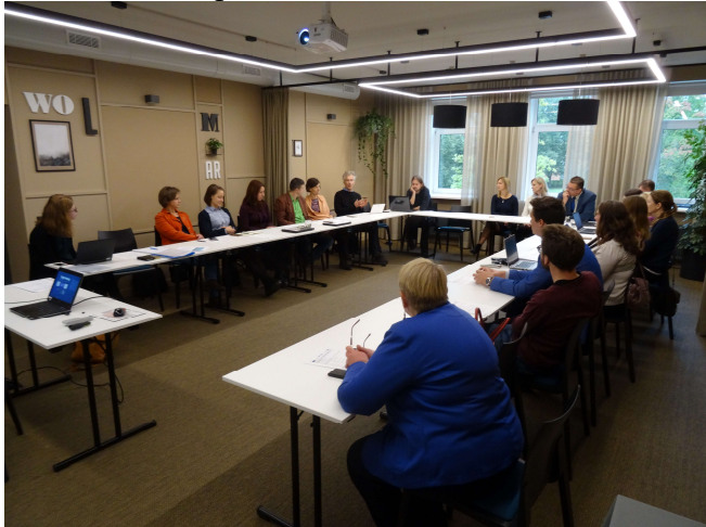
INSURE meeting in Valmiera, 2 nd October, 2018

On 2 nd – 4 th of October the project partners meeting took place in Valmiera. Issues on project progress and following actions were discussed. Presentations on project sites and remediation methods were held. An application was presented that covers the polluted Swedish and Latvian areas.