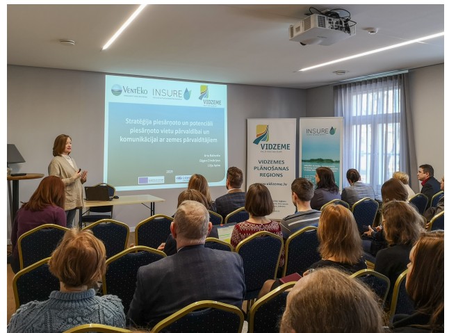
Workshop on strategy on governance of polluted and potentially polluted areas. Valmiera.

Participants of the workshop were introduced also to the prioritization tool for polluted and potentially polluted areas and representative from LEGMC informed about the developed data base and mobile app. The workshop was attended also by specialists from other regions of Latvia because this topic is crucial in whole Latvia.