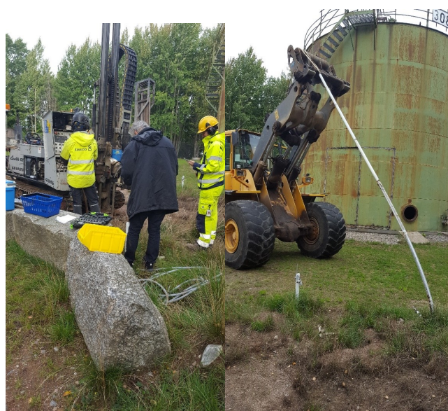
Pilot tests in Motala

The work with the remedial alternative selection, risk valuation and cost effectiveness analyses is ongoing in Motala. The planner and environmental inspector is working closely with the consultants. We have had weekly meetings to make sure the work is progressing in the right way and to extract information from the municipality.