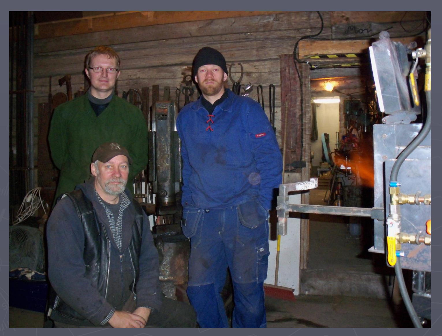
Thanks for listening