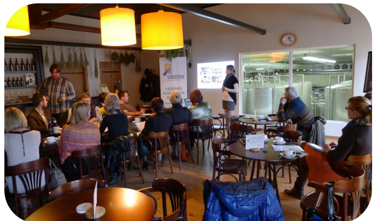
Discussion with Vidzeme high added value and healthy food cluster members on production of ecological juices and ciders in Vidzeme