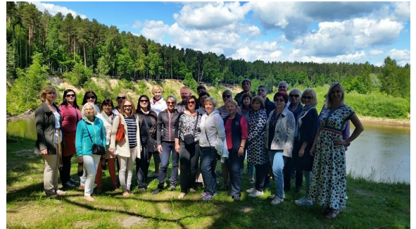
ALTA members' visit to Via Hanseatica tourism objects.

professionals was continued. There was a presentation of Via Hanseatica at Association of Latvia Travel Agents and Operators (ALTA) Annual conference . 17 ALTA members showed a great interest and visited tourism objects and service providers in Amata, Cēsis, Valmiera, Burtnieki, Valka, Valga, Strenči, Kocēni and Pārgauja municipalities.