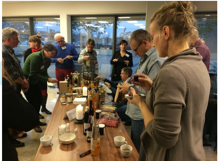
Work on taste and product development in the Agro Tech Foodture lab

present them and get a valuable feedback. Gained knowledge, contacts, experience and inspirations are already put to good use in all participating companies, after the Project. Companies have started the development of new, innovative taste solutions for their products, and are considering several options about new product development in the future. Collaboration with Agro Tech and Ideon Agro food has been strong already before, and this particular Project showed that such collaboration is very beneficial for food SME's and allows them to tap into new knowledge and expertise that can greatly help them advance their competitiveness.