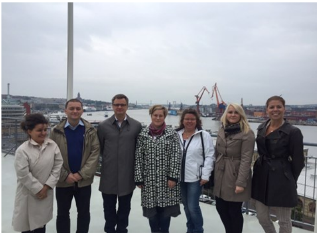
Project partners from Latvia, Sweden and Poland.

Project SEBCO (Social enterprises in partnership with the business community) aims to build knowledge and confidence in social enterprises, and to find methods to make social entrepreneurship visible as a vital sector of society. This project also compares how partnerships between social enterprises and the business community at large operate in the different partner countries and looks at the success factors.