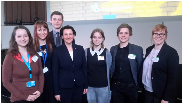
Latvian delegates with Minister of Education and Science of the Republic of Latvia

The project participants had a chance to get to know the best Youth projects from all around Europe, to present VPR's Youth Entrepreneurship Development project and to participate in